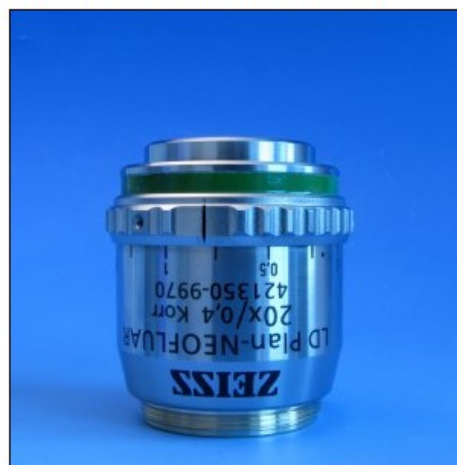
(D=0-1.5mm) (WD=8.4mm at D=0mm and WD=7.4mm at D=1.5mm)