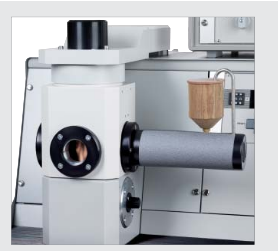
Production of the finest grained coatings with e-beam evaporation at highest vacuum conditions using a LN_2 cold trap.