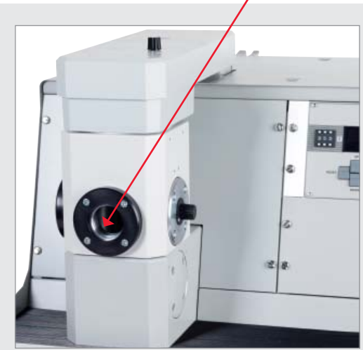
Combination of thermal resistance evaporation bottom up and high vacuum sputtering which offers the possibility of multiple layer systems with three different coating materials without breaking vacuum.

Thermal resistance evaporation top down with tungsten coil, tiltable rotary stage, SEM stubs on a 54 mm diameter specimen table.