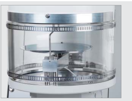
Triple high vacuum sputtering of a wafer on the height adjustable rotary stage.