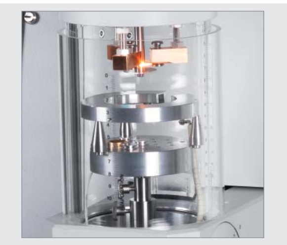
Carbon thread evaporation with glow discharge.