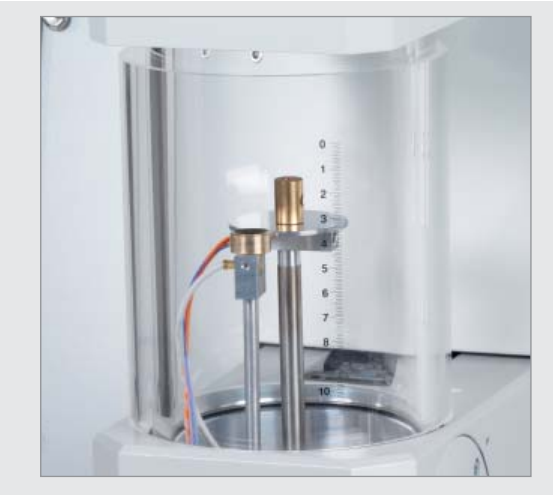
High vacuum sputtering using the bottom flange heating stage.