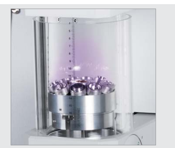
High vacuum single sputtering with a planetary drive stage and SEM stub mounts.