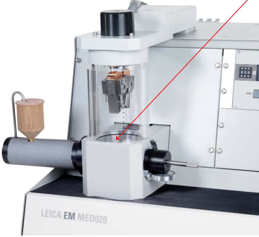
Freeze drying unit with electron beam evaporation using two e-beam sources, a counter flow loading device and specimen holder.